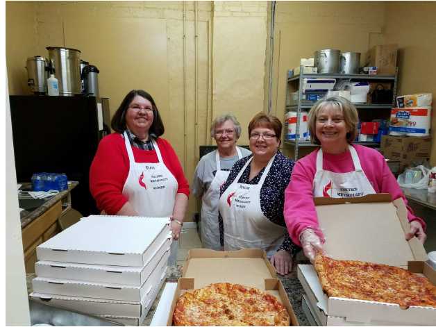
BCUMW feeding the Mission Kids

Will be meeting February 6th, 2017 at 6:00 PM.